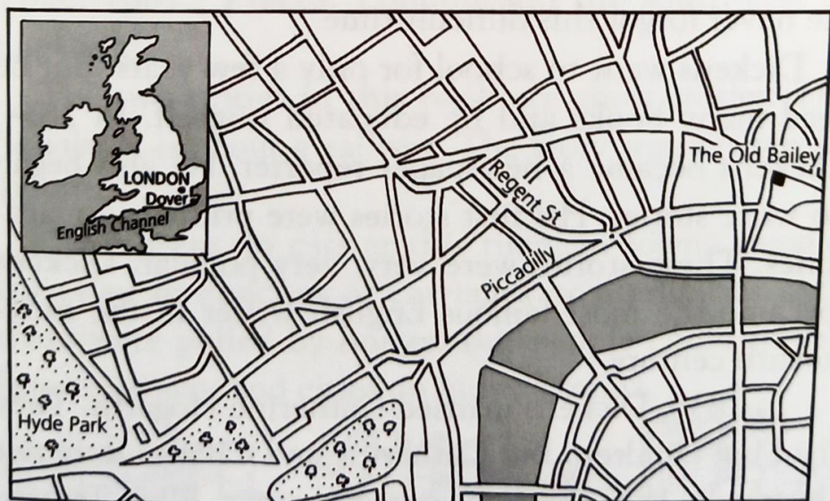
A Map of London in the 1860s